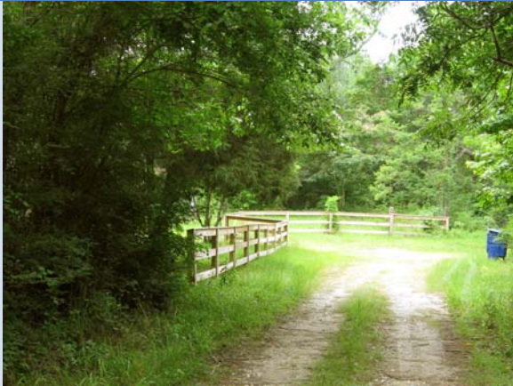
Approach down a shady drive