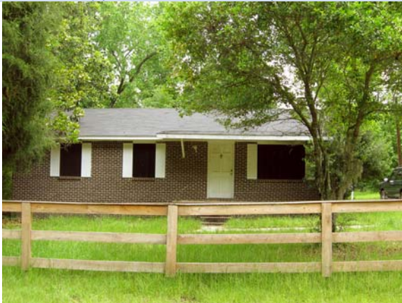
Front yard and view of covered front porch