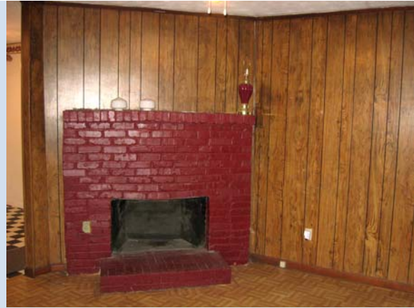
Living room has paneling throughout and a working brick fireplace insert.