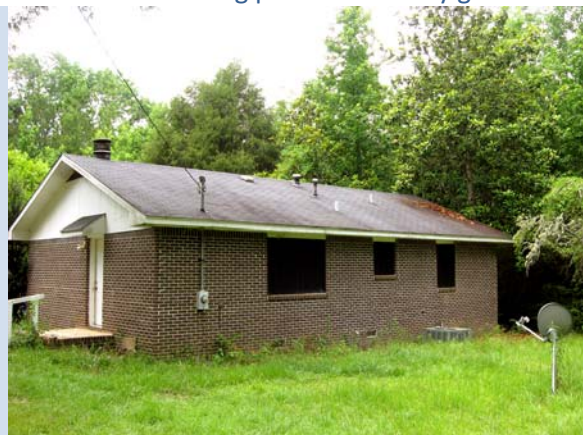
Back yard showing HVAC unit and satellite dish. Small pond is farther to the right.