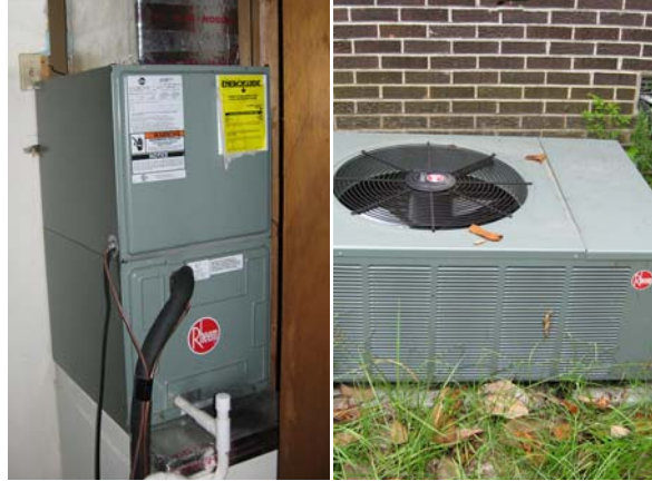
Rheem Central Unit for heating and cooling is about 15 months old. Electric air conditioning and propane heat.