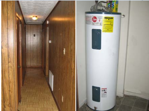
Paneled hallway connecting the three bedrooms, bath and laundry areas. Electric water heater is only __ years old.