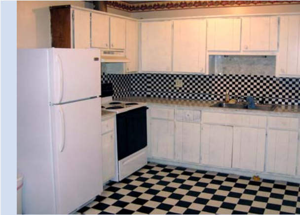
Country kitchen has a new refrigerator, almost new range and built in cabinets. Vinyl flooring.