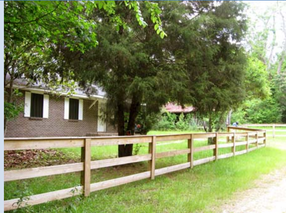
New board fence along front road