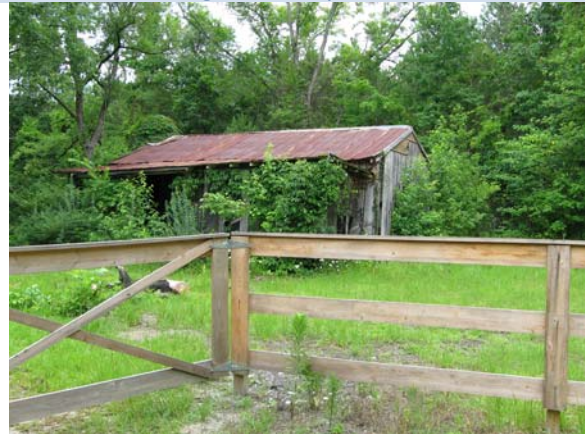
Old home place currently used as storage building, but could be restored as guest house or hunting club house.