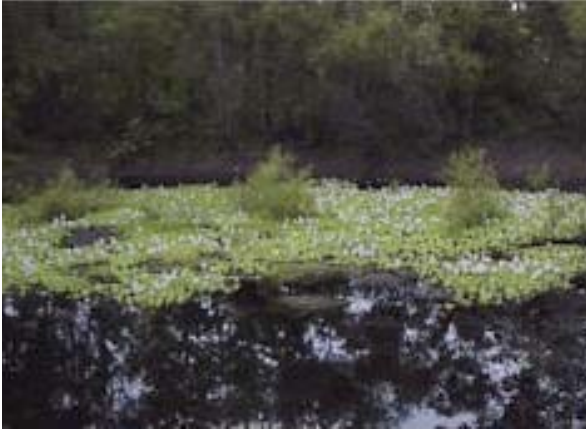
Small lagoon pond near the house