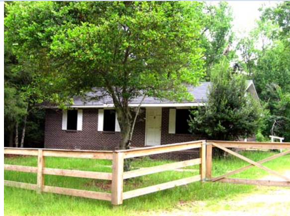
Front showing part of driveway gate