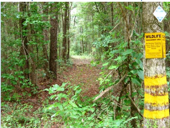
Barbour County Wildlife Management Area is open year-round to hiking